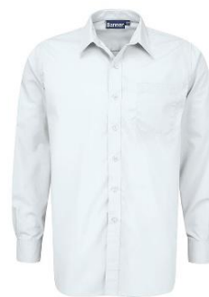
Boys Long Sleeve Shirt (2 Pack) Optional Item