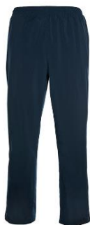
Trinity Tracksuit Pants Optional Item

Schoolwear for boys is shown to the right. Please click on an item and enter the quantity required into the correct box. Please note which items have been marked by the school as compulsory and optional.