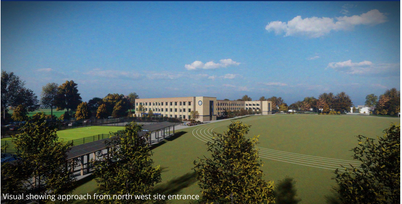
Visual showing approach from north west site entrance