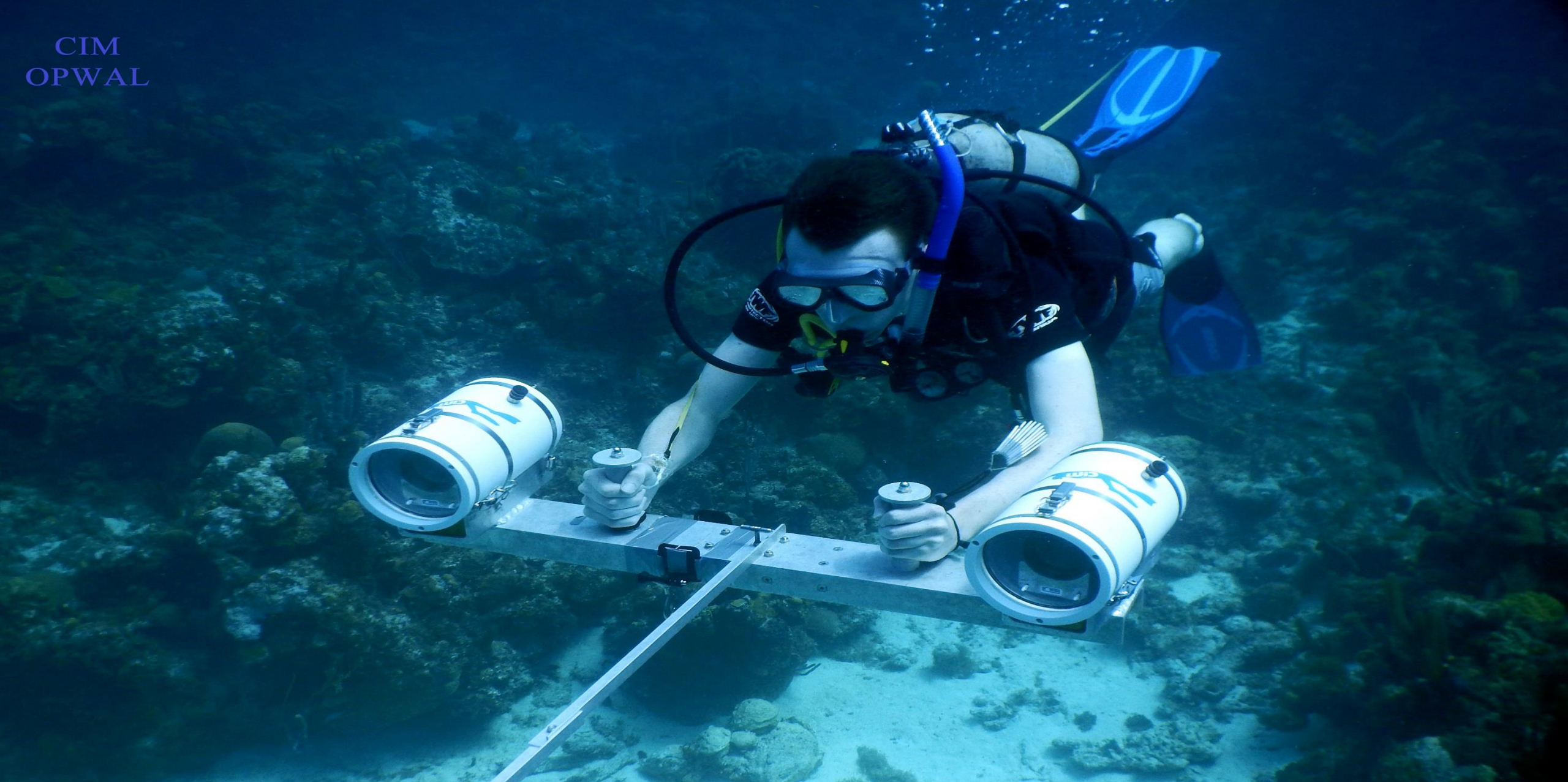
Collecting stereo video data