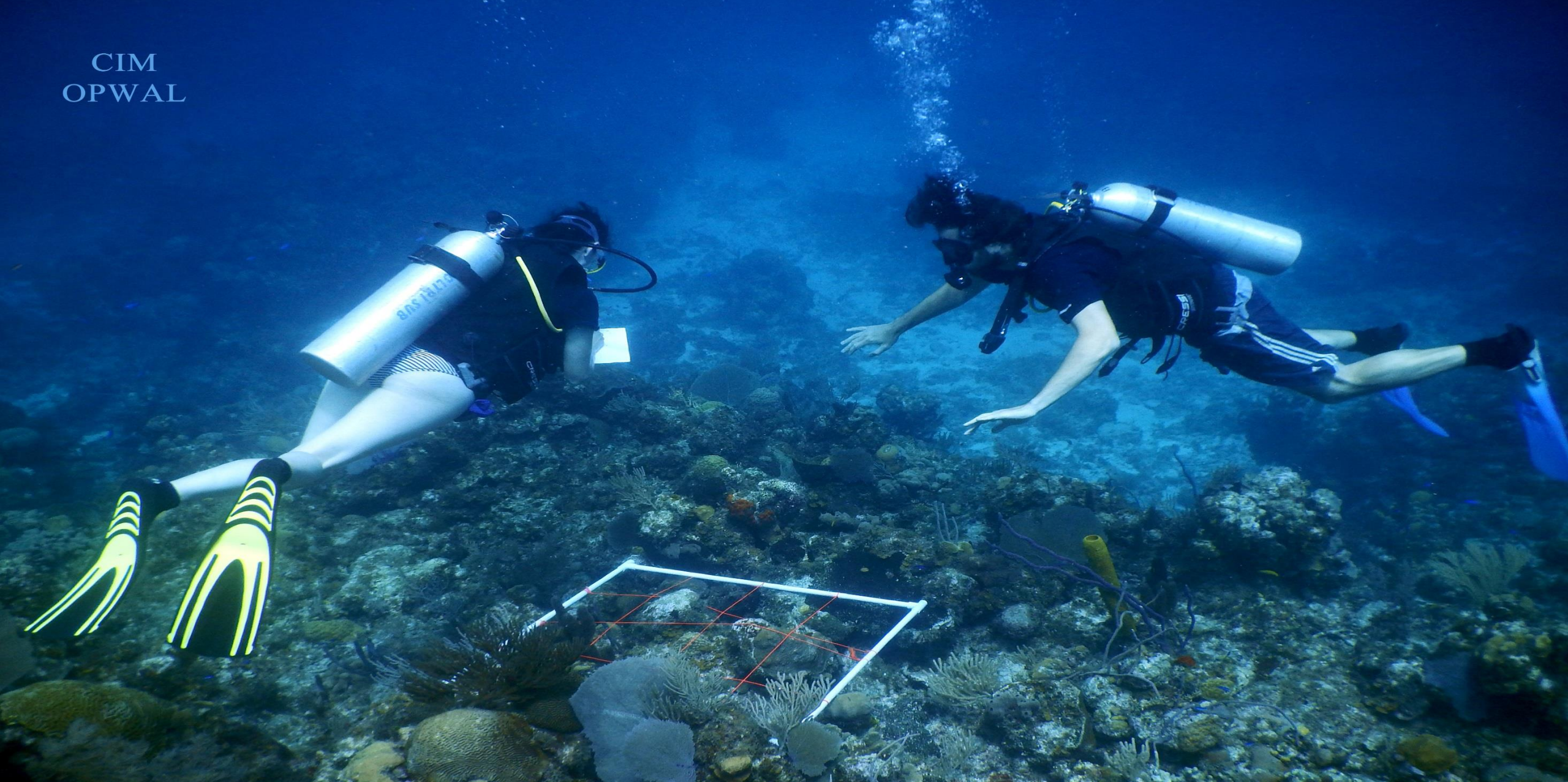
Coral Reef profiling with interrupted belt transect