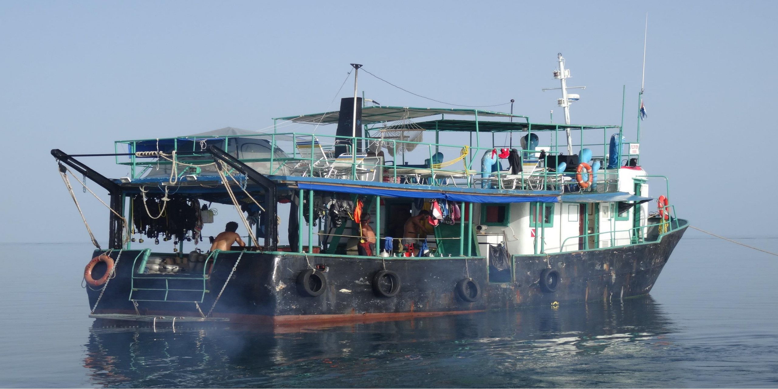
The Felipe Poey- “home” for 3 days