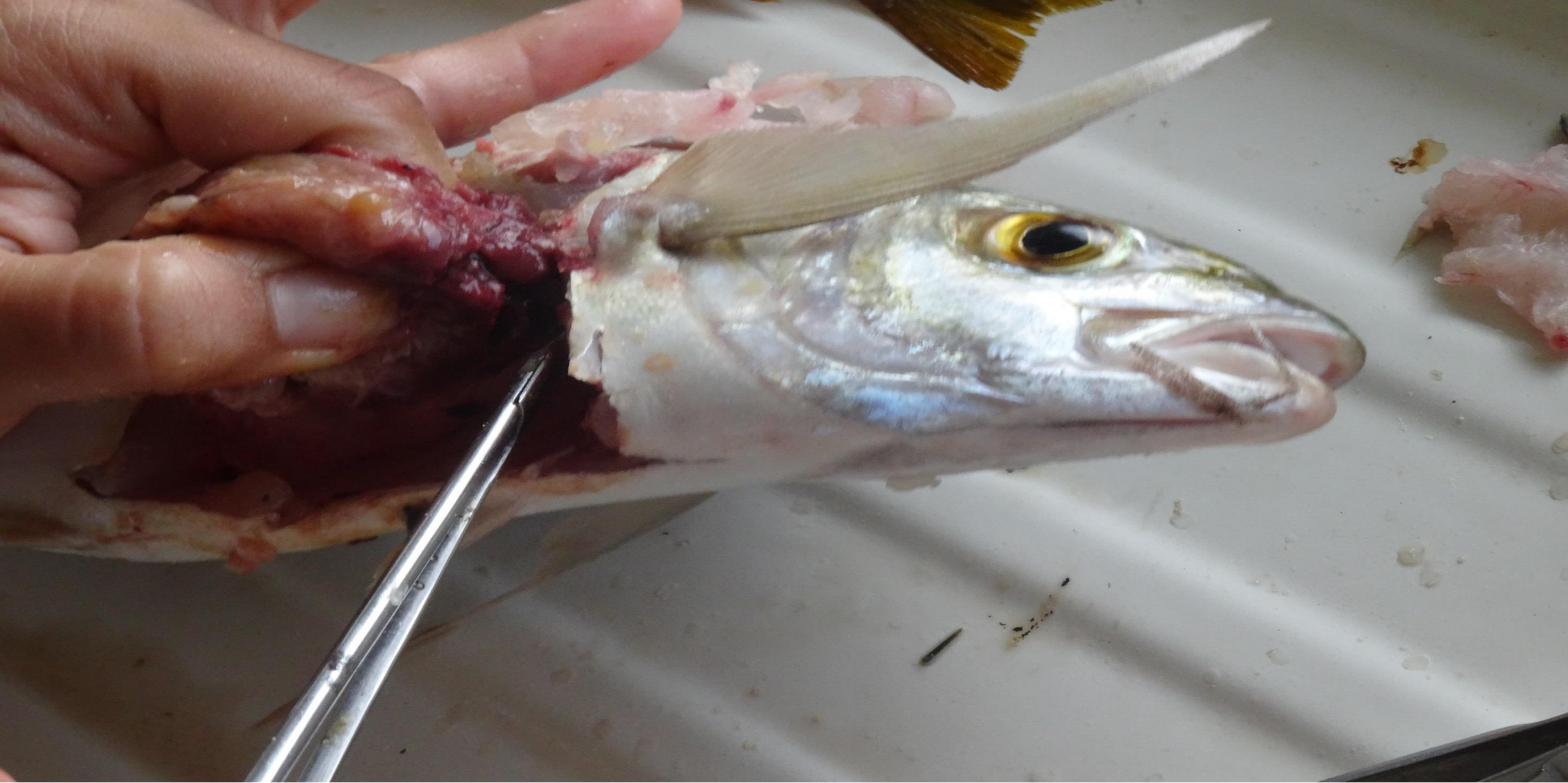
Fish ID and vital statistics survey