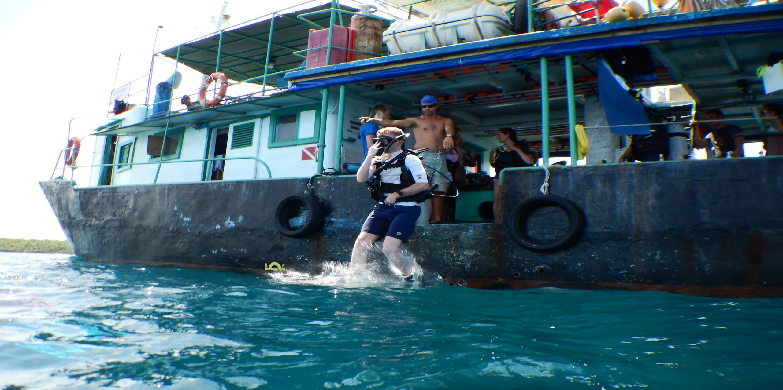
Coral Reef Ecology Studies from the Felipe Poey