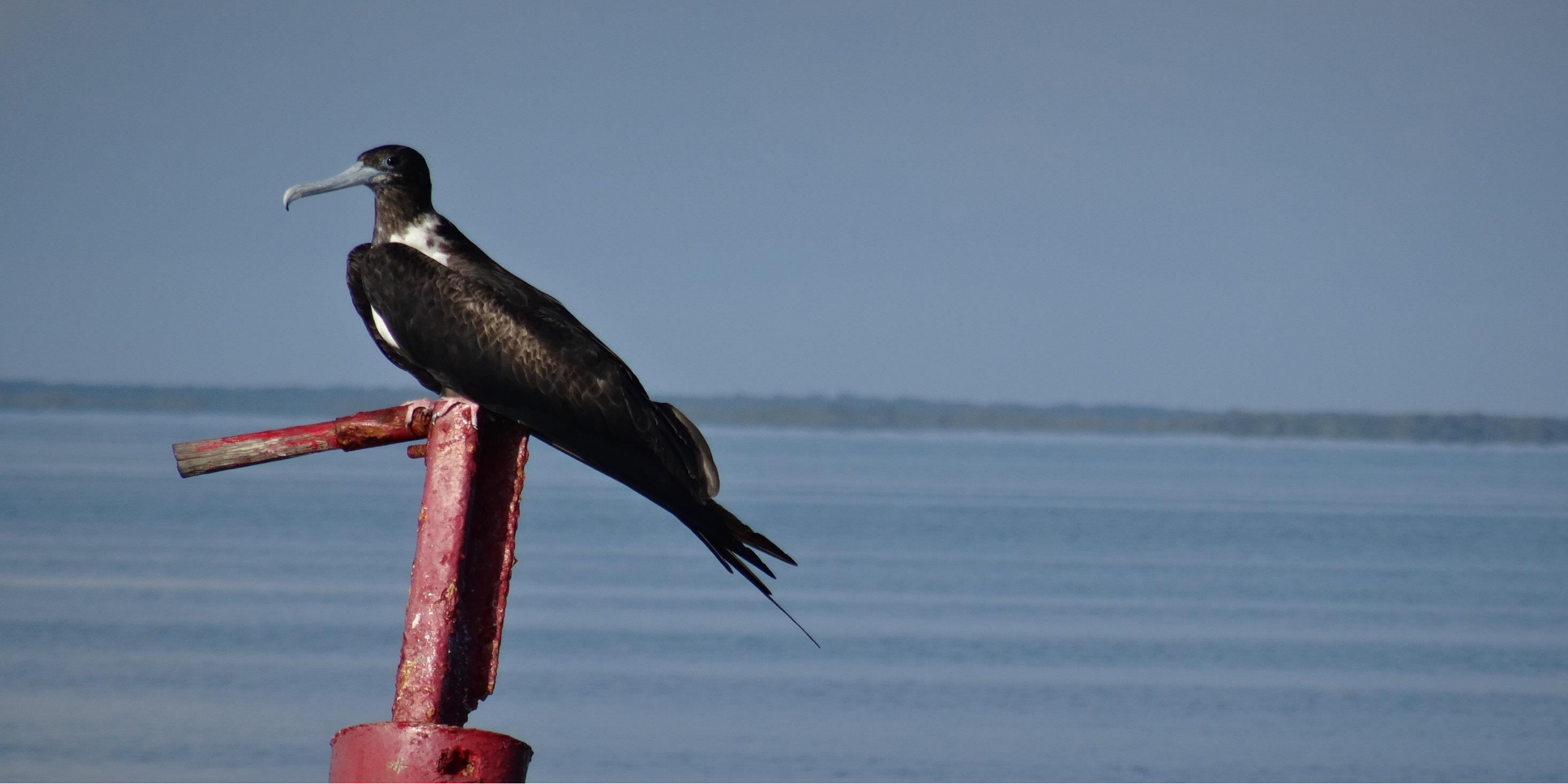
The Magnificent Frigatebird