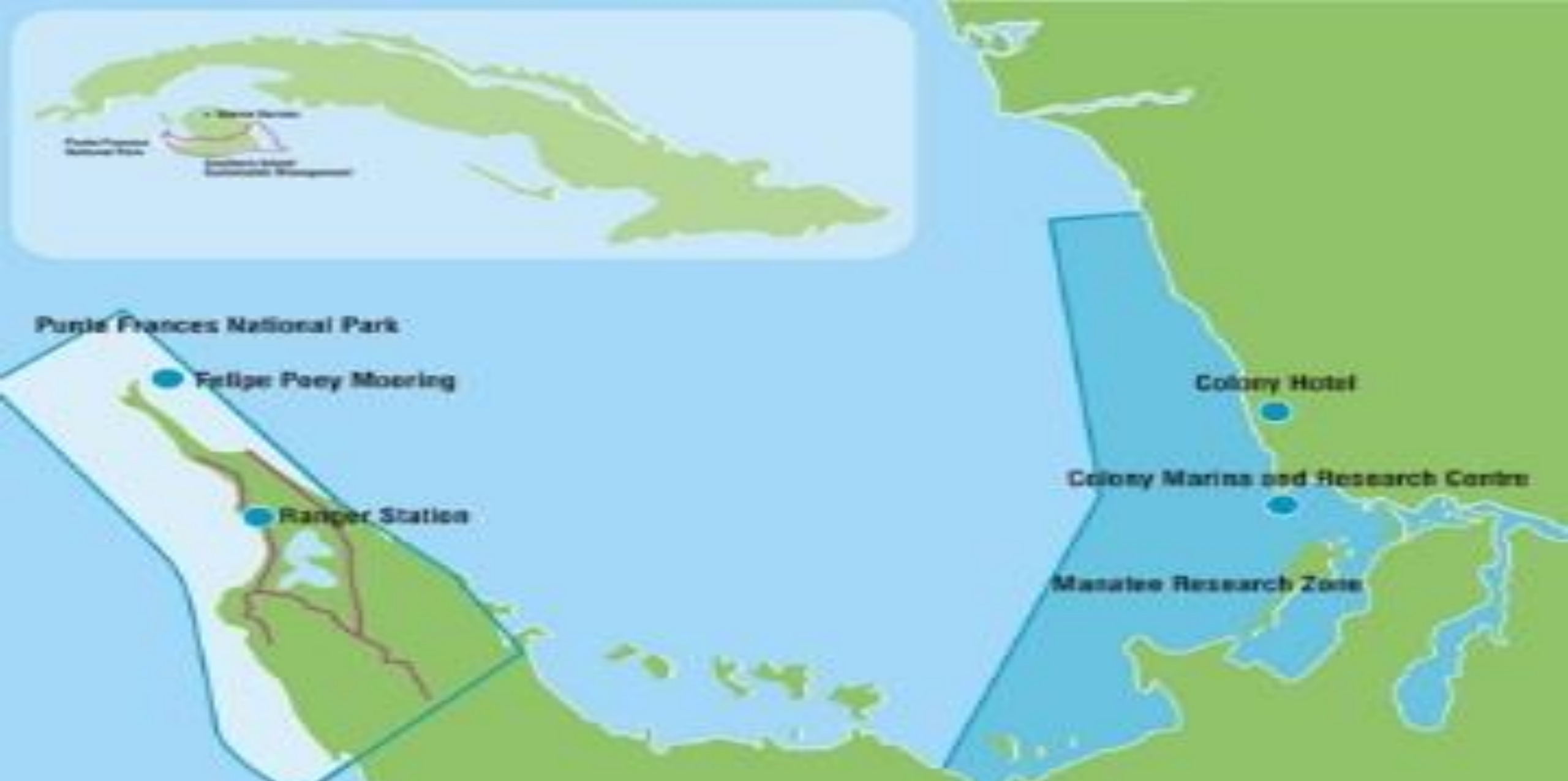
Punta Frances National Park map