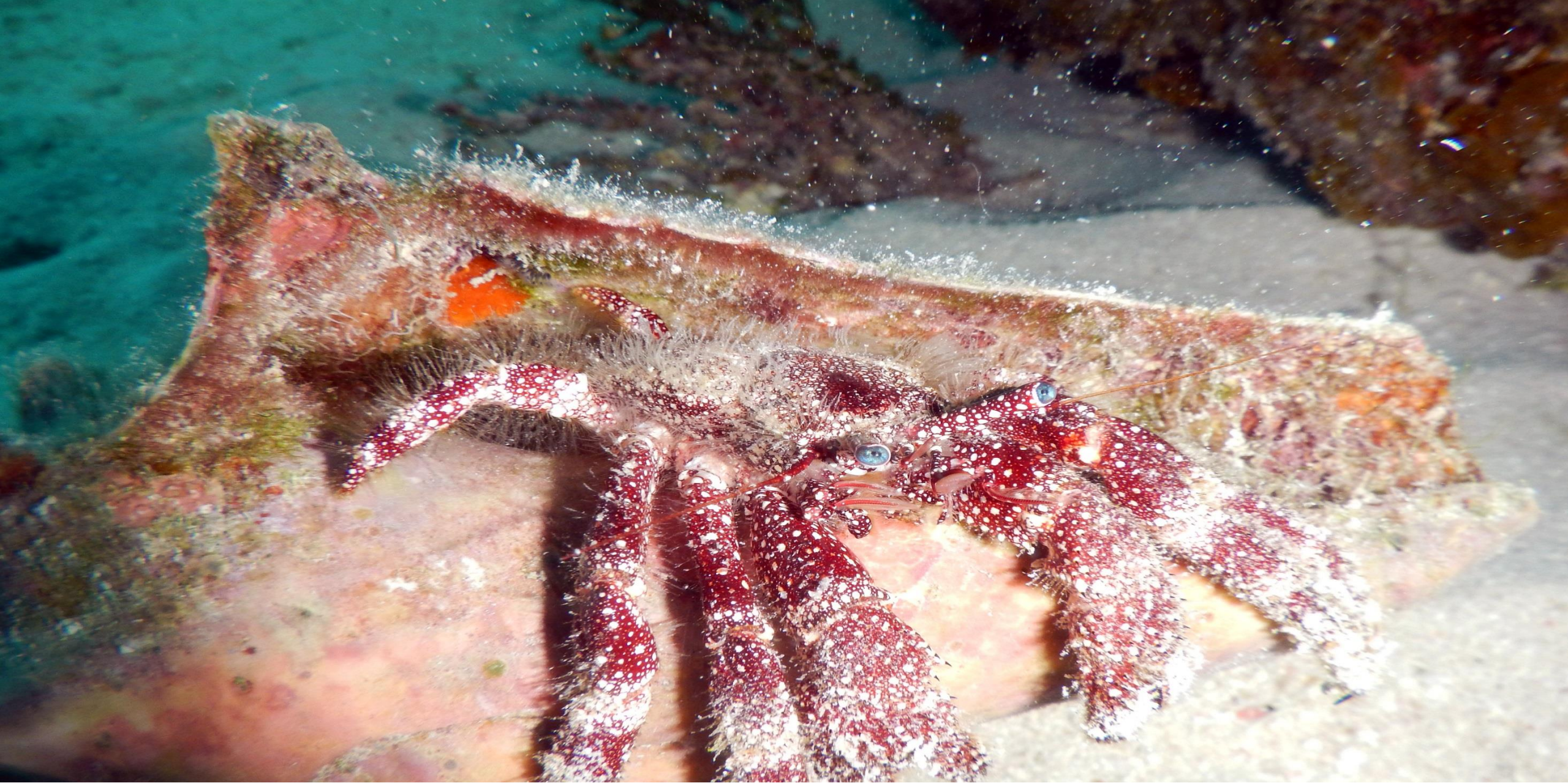
Hermit in a Queen Conch shell