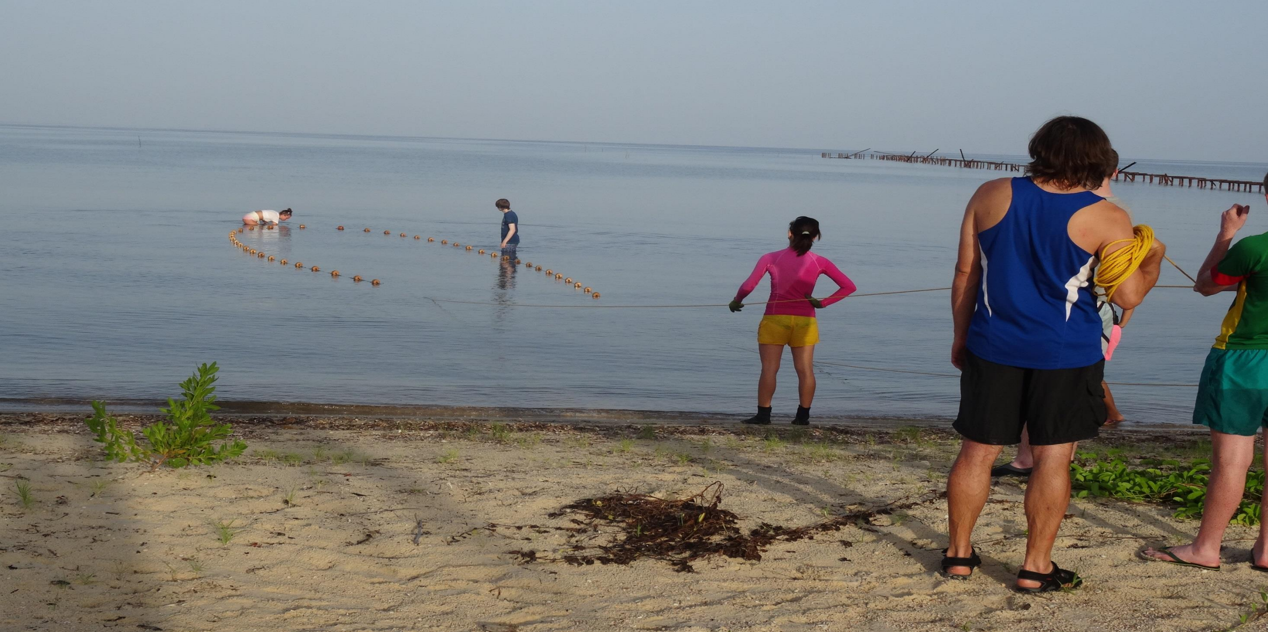
Population estimation in Siguaneya Bay