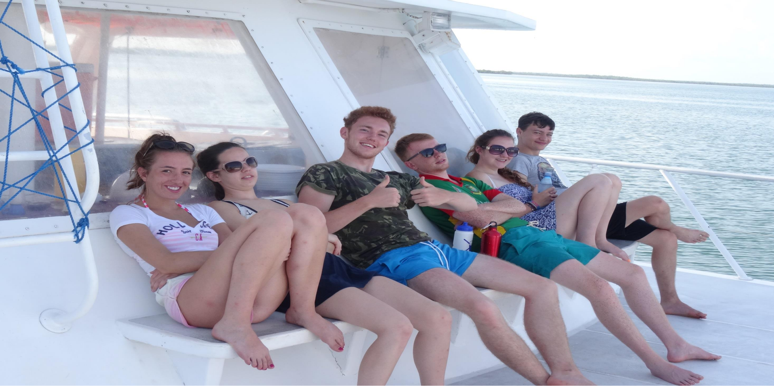
On the way to the dive site