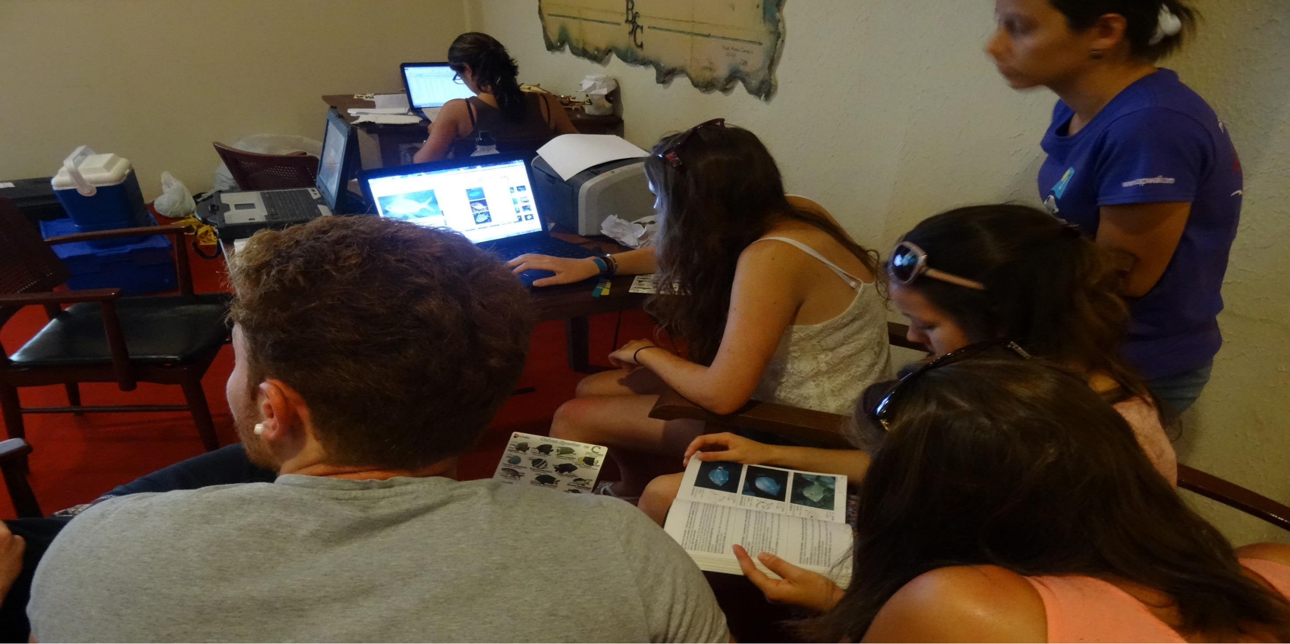
Identifying reef species