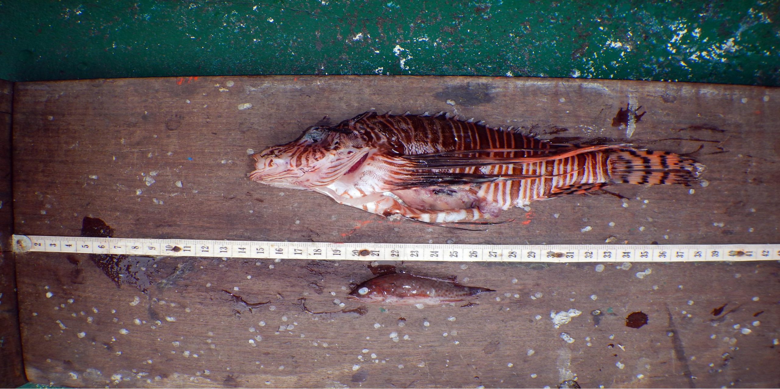
Lionfish and its prey