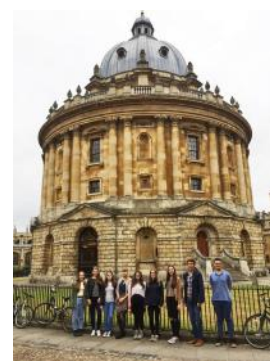
The Radcliffe Camera