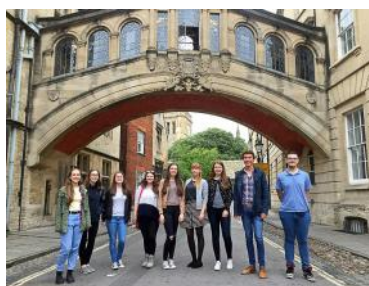
Oxford's Bridge of Sighs