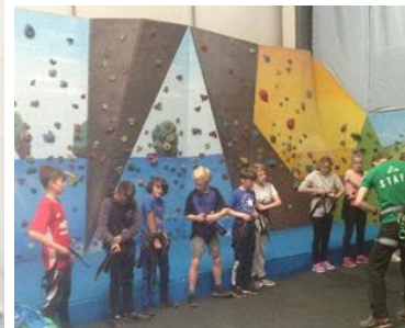
Students ready for action!

Please check our website for our latest news and any changes to the school calendar.