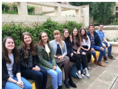
The new garden at Pembroke College.