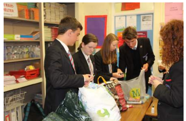
Our donations being repacked at the Hungarian Border